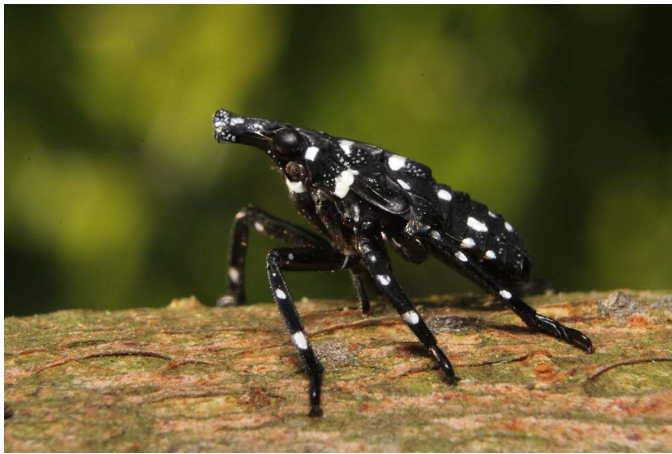
Early Stage Nymph of Spotted Lanternfly An early stage nymph (1st-3rd instars). These hatch from the eggs and are just a few millimeters in length. As they age, they grow to be ~1/4 inch long. They have black bodies and legs, and are covered in bright white spots. They are strong jumpers, and will jump when prodded or frightened.